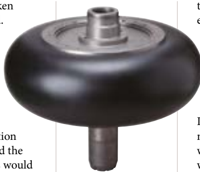
Top: The large operator panel for a 45in UZER hydraulic press

He's more convinced by PCIs, though. "Some customers love them, others are still unconvinced, but they are definitely becoming more popular," he confirms. "We have our own patented stack PCI that we can put behind our presses, or install as an upgrade to older ones, to improve uniformity – including for older mechanical presses. In that scenario the customer does not need to invest in a new press to improve uniformity. It can also cut the cycle