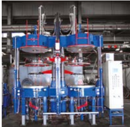
Left: 52in UZER floating-column type hydraulic press. Clever packaging in the latest presses is enabling them to accommodate larger tire sizes but still sit within the footprint of older designs, enabling tire makers to make straight swaps when updating machinery, or allocate less floor space in new-build factories