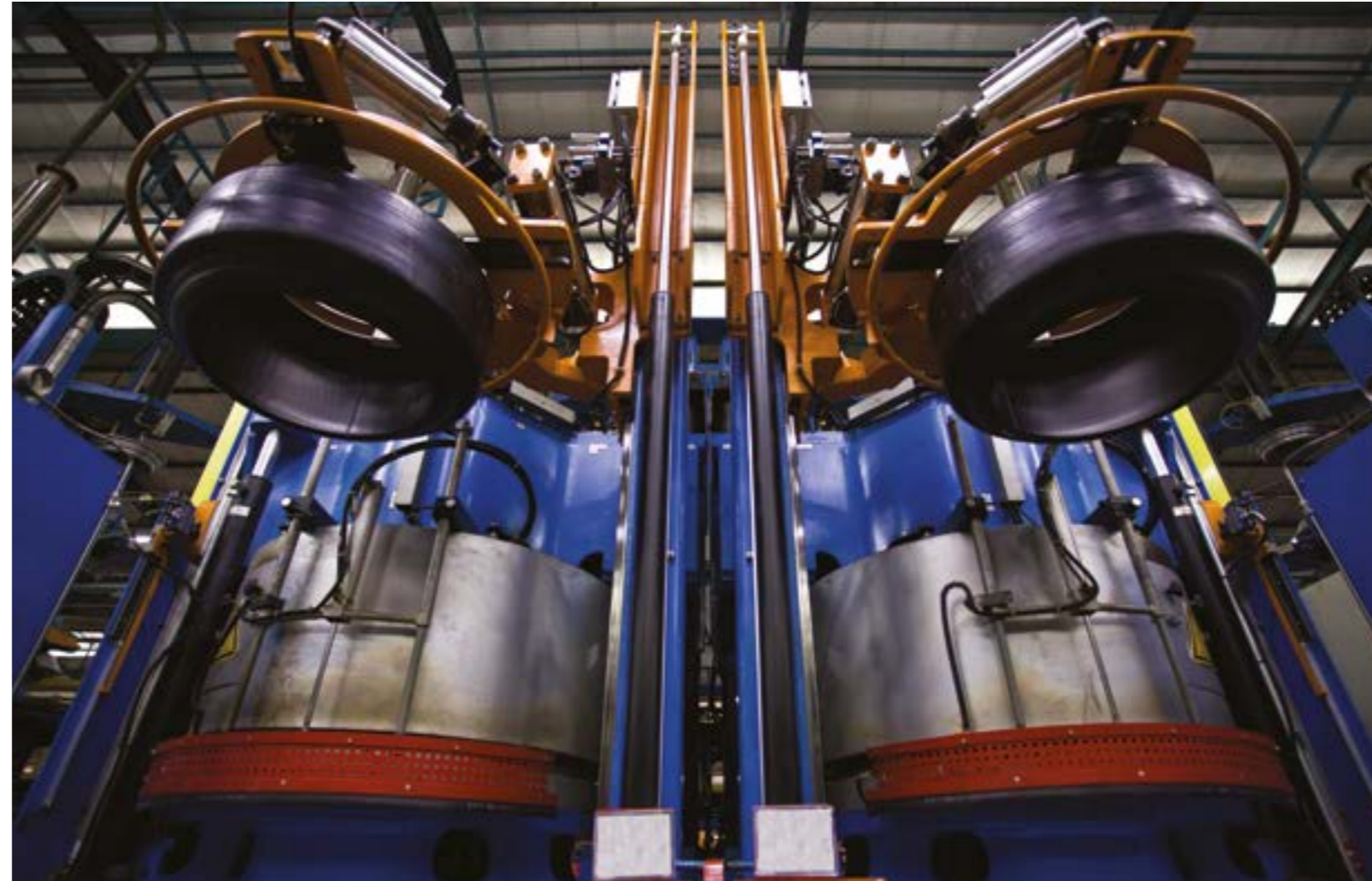
Above: All of HF Group's curing presses are made in Croatia. The company's headquarters remains in Hamburg, Germany

them, but there hasn't been a big breakthrough so far. Steam is still the cheapest and fastest option."